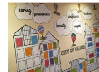
"The St. Paul's Way: City of Values"

The school utilises the church on site for worship and celebrations throughout the year. Formal catechism is undertaken by the parish outside school time for occasions such as First Holy Communion and Confirmation. The parish priest acts as chaplain to the school and supports us in major feasts and celebrations. The school has benefitted in recent years by receiving donations from the parish, including established links with the SVP Society.