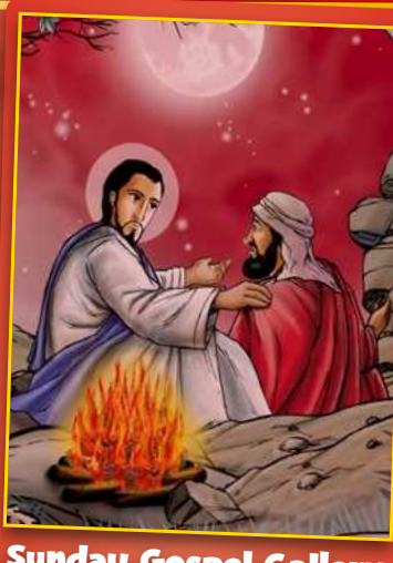
Sunday Gospel Gallery

Which word or words stood out for you in this Sunday's Gospel, and why? Spend a few relaxing moments pondering the picture together. Share any thoughts before moving on.